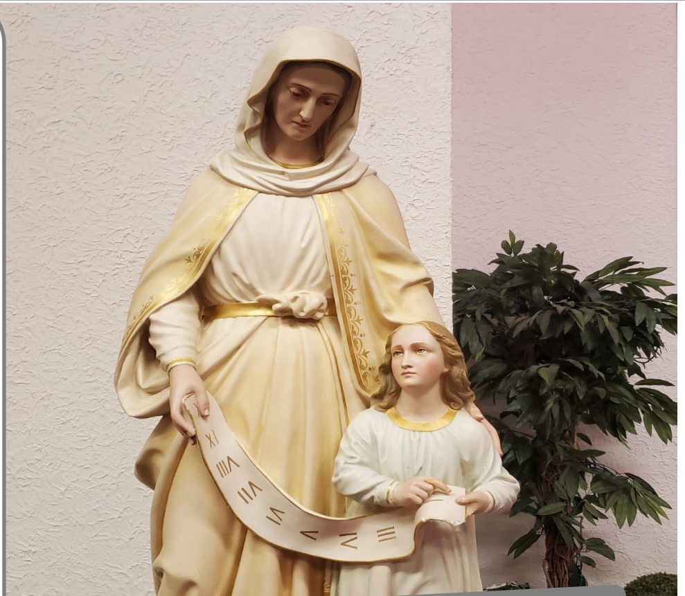
Ascension of the Lord May 16