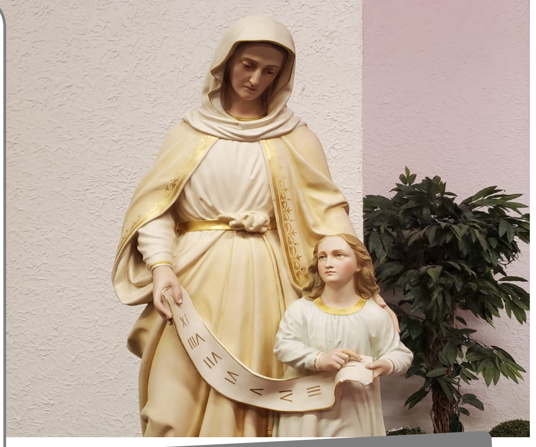
Passion Sunday 28<sup>th</sup> March