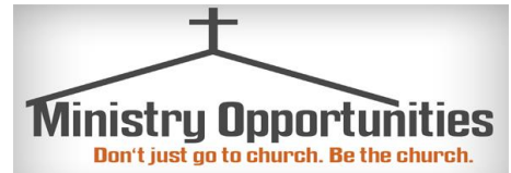
In Saint Ann's facilities

If you're looking for a fun and very important way of helping at St. Anne's, please consider volunteering to help count the weekly collection after Mass on Sundays. The Parrish needs to have two counters present.