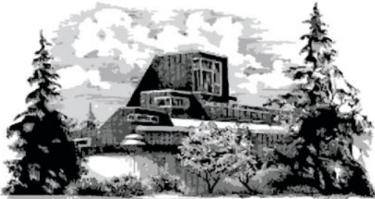
St. Anne Parish 1701 Cowan Crescent Regina SK Phone: 306.586.0449