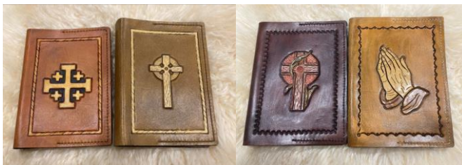
Jerusalem Cross / Celtic Cross / Cross With Vine / Praying Hands