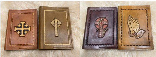
Jerusalem Cross / Celtic Cross / Cross With Vine / Praying Hands