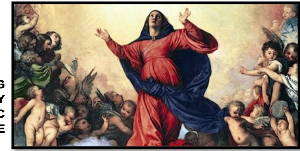
TITIAN | PUBLIC DOMAIN

THE ASSUMPTION IS THE FEAST THAT CELEBRATES MARY'S BEING TAKEN BODY AND SOUL INTO HEAVEN AT THE END OF HER EARTHLY LIFE. AMONG THE VARIOUS CELEBRATIONS IN THE CATHOLIC CHURCH, ONE THAT CAN BE CONFUSING TO SOME IS THE ASSUMPTION OF MARY, CELEBRATED ON AUGUST 15.