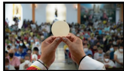
Papieska Swiatowa Siec Modlitwy #image_title

The great treasure of the Catholic Church is the Eucharist -- Jesus himself hidden under the appearances of bread and wine. We believe, as the Catechism states, that "In the most blessed sacrament of the Eucharist 'the body and blood, together with the soul and divinity, of our Lord Jesus Christ and, therefore, the whole Christ is truly, really, and substantially contained '" (CCC 1374).