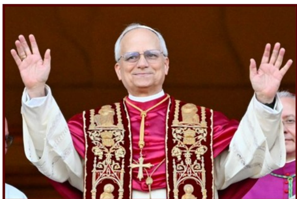
Pope Leo XIV