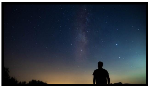
Ivan Berrocal | Shutterstock